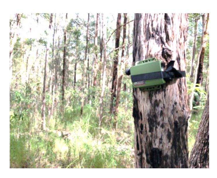
Figure 12: Song Meter Mini set in the field. A python lock or strap may be fitted through the top loops in the unit.